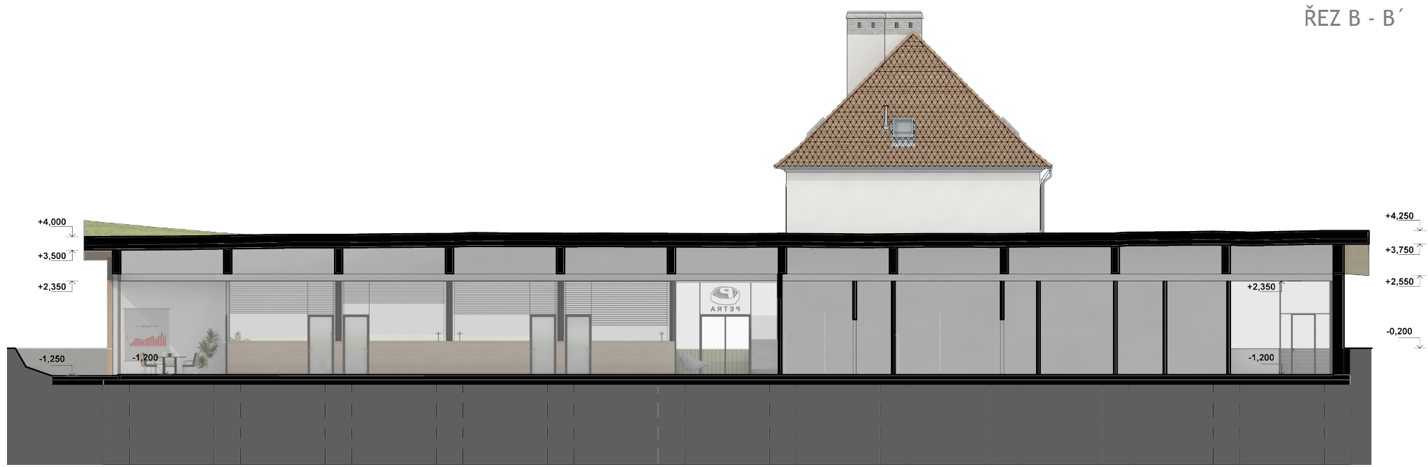
ŘEZ B - B'